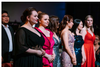
KONCERT LAUREATOW, 2023. FOT. KINGA PIRAK