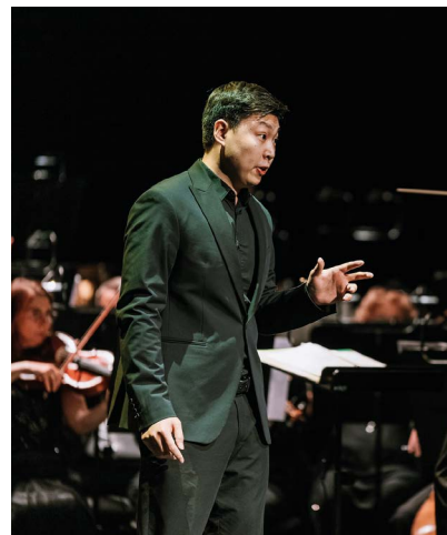
CHAO JULIO 2023

3. The list of applicants who qualified to participate in The Competition will be