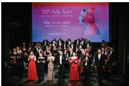
KONCERT LAUREATOW, 2023. FOT. KINGA PIRAK