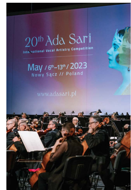
2023, FOT. KINGA PIK

7. The participants with the highest combined score from Stage I and Stage II will advance to the Final. All prizes will be awarded according to the combined score from all three Stages.