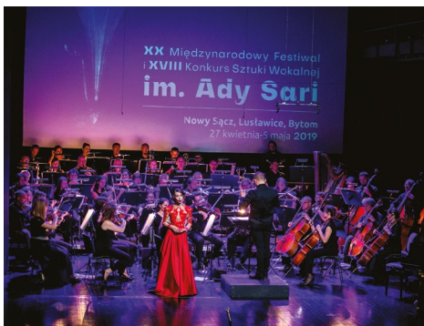
DIANA ALEWE, ORCHESTRA OF THE SILESIAN OPERA UNDER THE DIRECTION OF SEBASTIAN PERŁOWSKI, 2019

SOKÓŁ Małopolska Cultural Center in Nowy Sącz