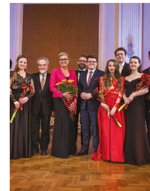
THE WINNERS GALA CONCERT. SILESIA OPERA IN BYTOM 2019.

3. MCK SOKÓŁ stipulates that in the event that the authorized authorities of the Republic of Poland announce a ban on organizing cultural events, including the 19 th Ada Sari International Vocal Artistry Competition – not at the fault of MCK SOKÓŁ – The Competition will not take place. In this case, immediately after the decision to cancel The Competition, all the entry fees will be refunded. The refund will be done by transfer to the participant's bank account or other account indicated on the entry form. If the participant has requested an invoice, the funds may be reimbursed only after issuing by MCK SOKÓŁ a correction of the invoice which the participant has to sign and return to MCK SOKÓŁ.